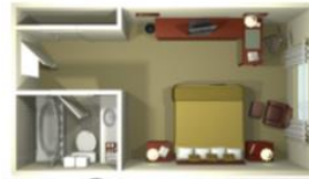
Resident or Patient Rooms